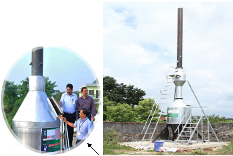
Calicut Airport commissioning Solid waste incinerator with pollution control system